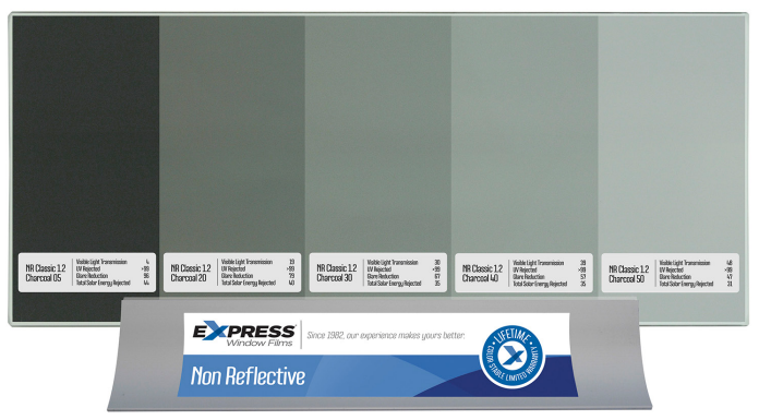
Assembled display with aluminum base and all labels centered and balanced perfectly.