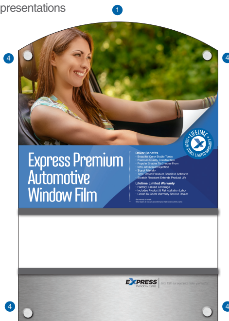
Display dimensions, 20"x30"