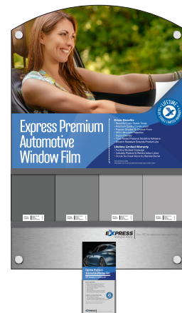
Display with examples of 1, 2, 3 or 4 acrylic holders with brochures installed.